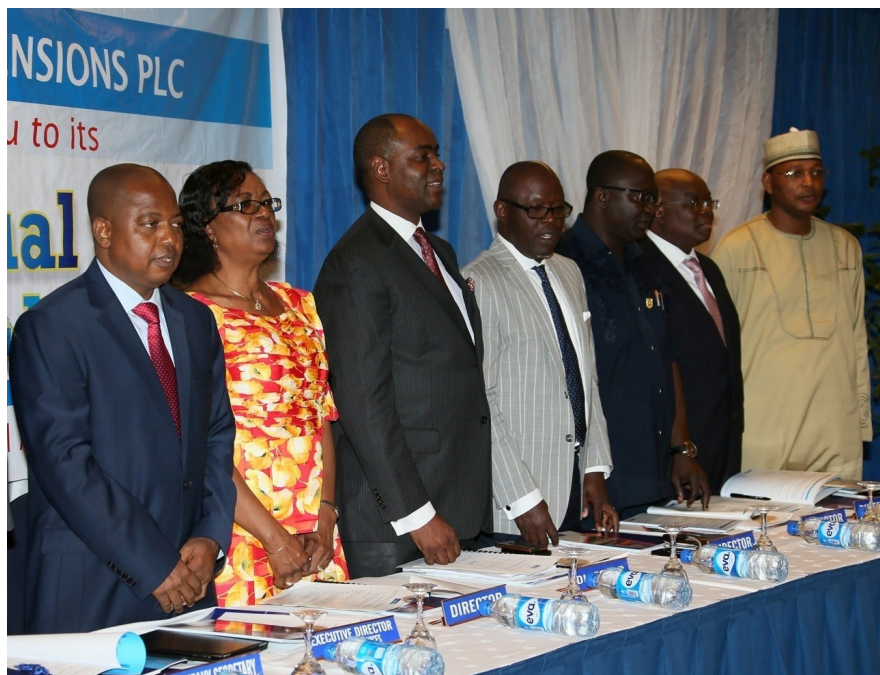
A cross section of Directors during the 6th Annual General Meeting recently in Abuja

Nigeria's Finance Minister, Dr Ngozi Okonjo-Iweala, says Africa is yet to harness the potentials of the pension scheme in the continent, with a current asset base of funds capable of addressing the continent's infrastructure challenges. She further advocated a review of regulations and laws governing the investment of pension funds, explaining that Nigeria had started the review of the laws and regulations, stressing that the huge long-term funding gaps in infrastructure development could be addressed with such funds.